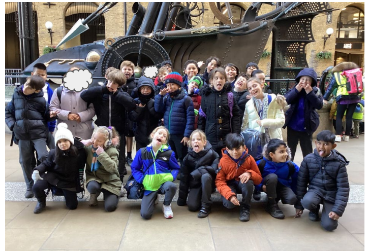
Unicorn Theatre Trip