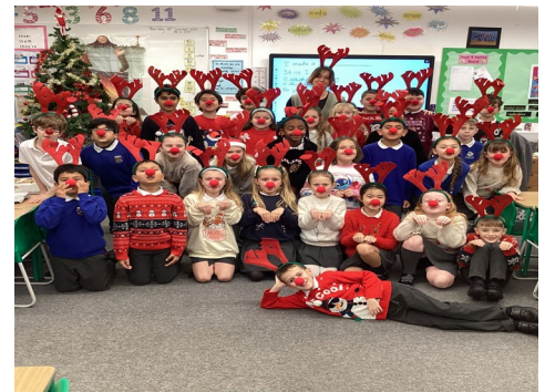
Christmas - Rudolph Run and KS2 Christmas Concert